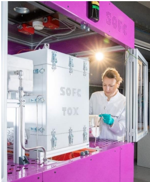
Fig. 1 Demonstration system for carbon-free generation of electricity with ammonia in high-temperature fuel cells (SOFCs).